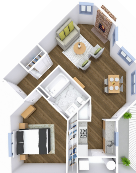
GS-B11 Hacienda 750 SQ FT