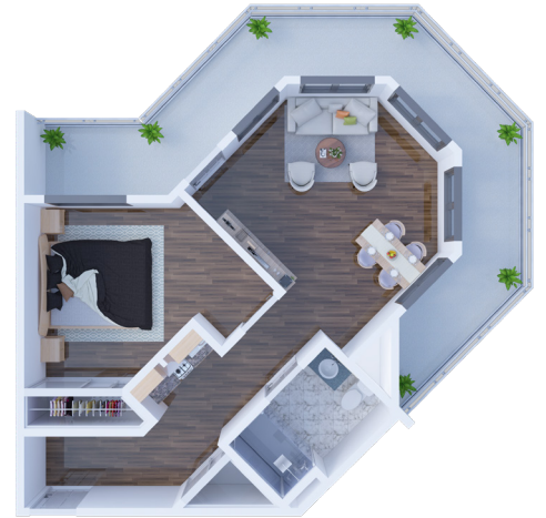
B4 One Bedroom 592 SQ FT