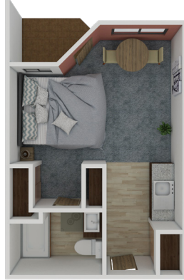
A1 Studio 398 SQ FT