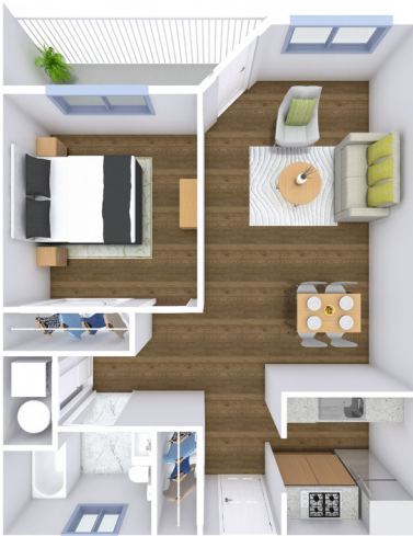
GS-B8 Palacio 690 SQ FT