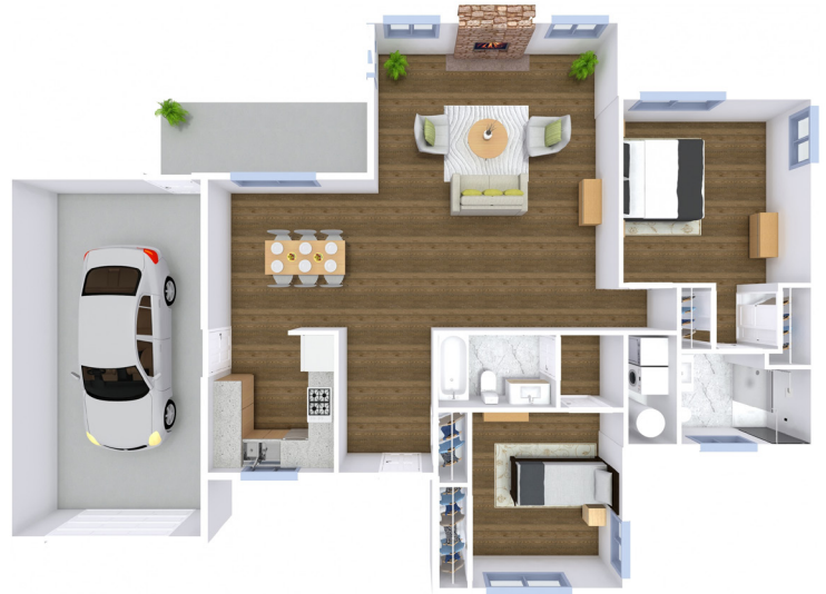
COT-C1 Grandioso 1,242 SQ FT

Solstice Senior Living at Rio Norte 1941 Saul Kleinfeld Drive, El Paso, TX 79936 (855) 563-5036 SolsticeSeniorLivingElPaso.com