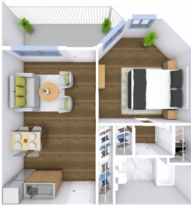
B1 One Bedroom 545 SQ FT