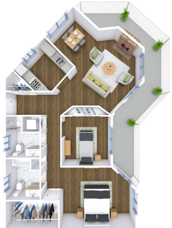
GS-C5 Grande 1,018 SQ FT