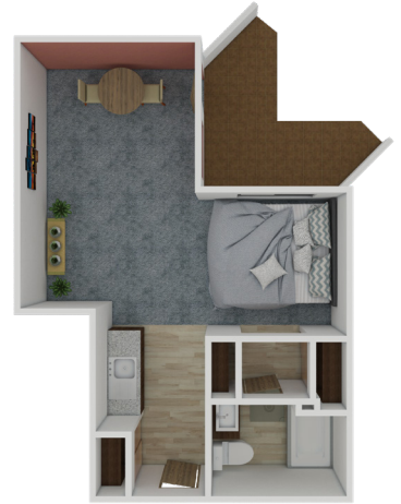
A3 Studio 527 SQ FT