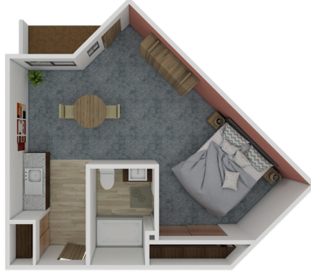
A6 Studio 509 SQ FT