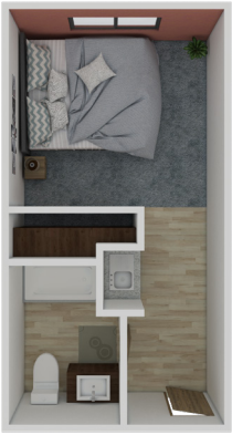
A7 Studio 325 SQ FT

Solstice Senior Living at Rio Norte offers several floor plan choices to suit your needs.