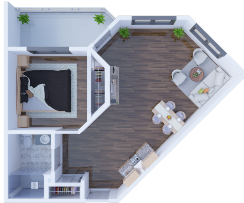
B6 One Bedroom 575 SQ FT