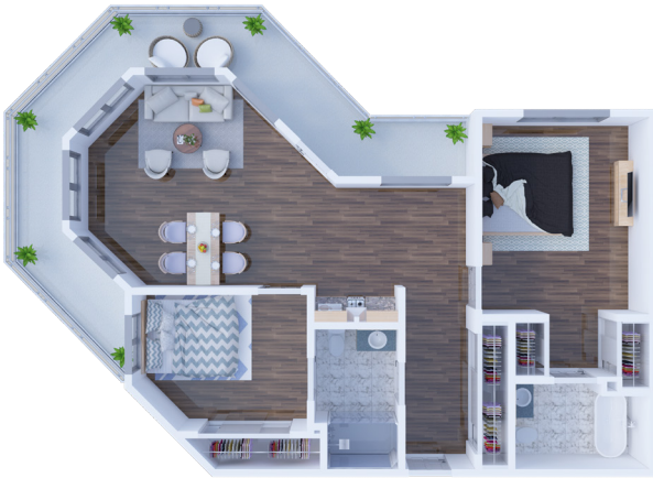
C1 Two Bedroom 901 SQ FT